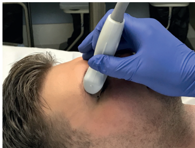
Figure 1. Measurement of the optic nerve sheath diameter

in both axial and transversal planes, as in some cases a certain probe position offers better views of the optic nerve. [20] Axial-plane measurements yielded slightly higher values compared with sagittal plane measurements (median difference 0.15 mm, range 0-0.3 mm). [21] The exact number of measurements that should be performed remains unspecified. Goeres et al. demonstrated that a mean of four measurements is more precise (in terms of the measurement with the smallest variance: intraclass correlation coefficient (0.77)) compared with a single measurement. [22] Slight rotation of the probe could also offer better visualisation of the optic nerve.